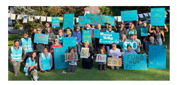
Campaigning for more budget action on climate in Moonee Valley